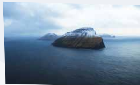
The Islands and the Whales

THE ISLANDS AND THE WHALES MIKE DAY The Faroe Islanders have always eaten what nature provides. Hunting whales and seabirds kept them alive, providing a way of life they loved; a life to pass on to their children. But today this tradition faces a grave threat. It is not the controversy surrounding whaling that threatens the Faroese way of life; the danger comes from the whales themselves due to the effects of the polluted oceans. What once secured their survival now endangers their children and the islanders must make a choice between health and tradition. Warning: contains disturbing scenes. 81' / UK GENRE: CULTURE / ENVIRONMENT