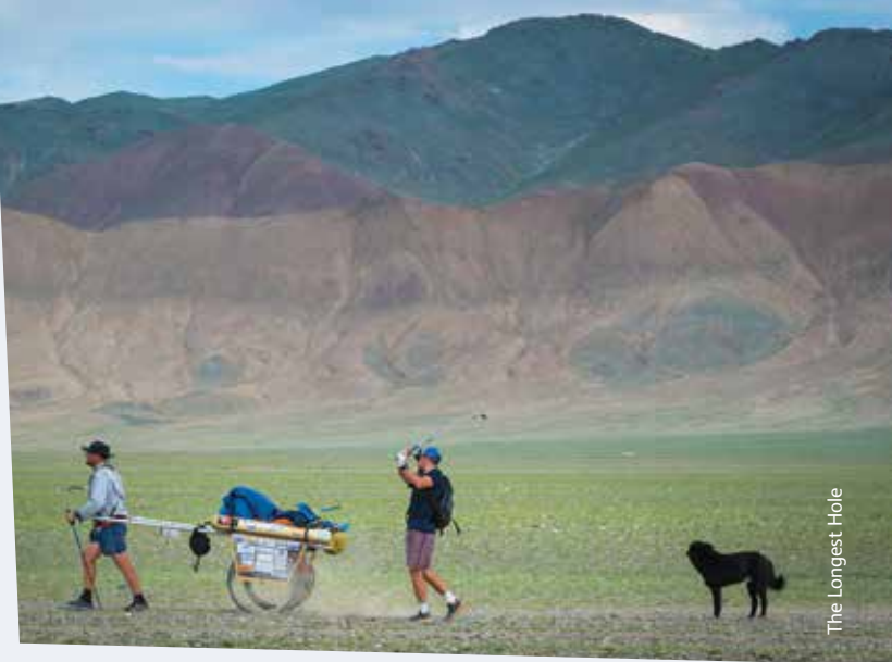
The Longest Hole