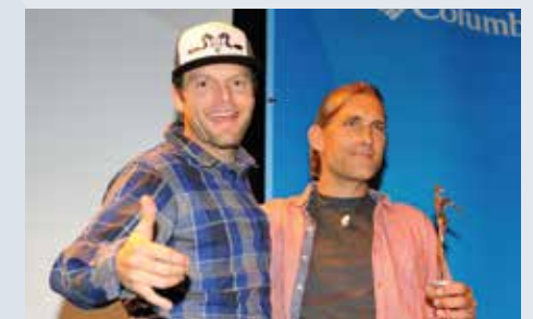
2017 winners of Best Adventure & Exploration film – Into Twin Galaxies