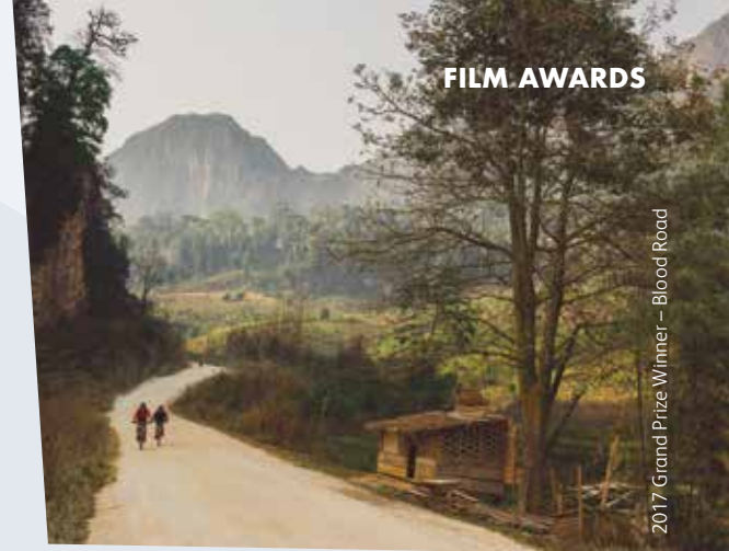
2017 Grand Prize Winner – Blood Road