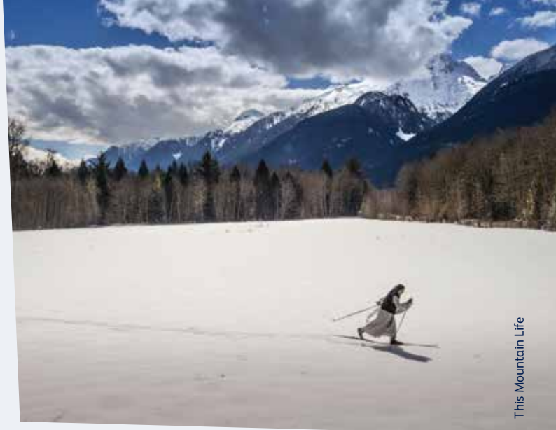
This Mountain Life