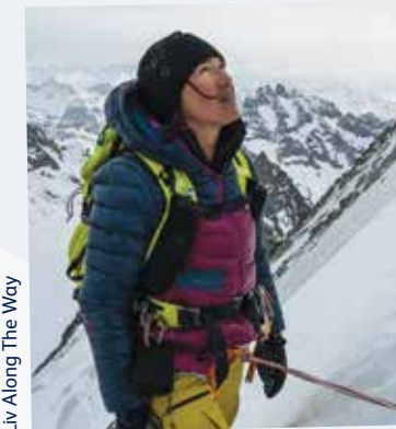
Liv Along The Way

The first female Afghan mountaineering team navigate their first expedition and fight for recognition as athletes amongst their country, culture and families. Note: contains disturbing scenes. 50' / USA