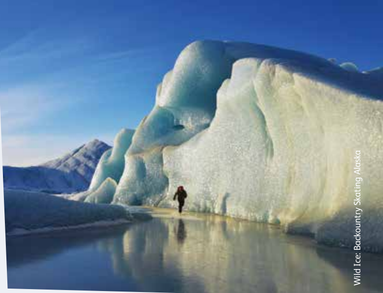
Wild Ice: Backcountry Skating - Alaska