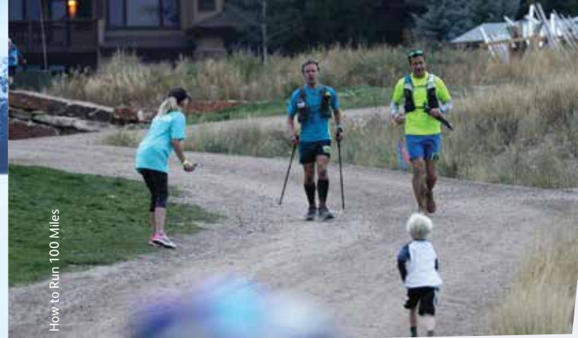
How to Run 100 Miles