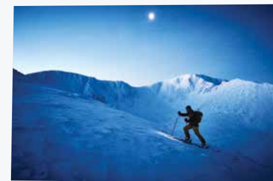
Every Few Winters