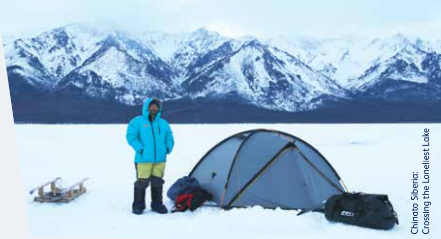
Chinato Siberia: Crossing the Loneliest Lake