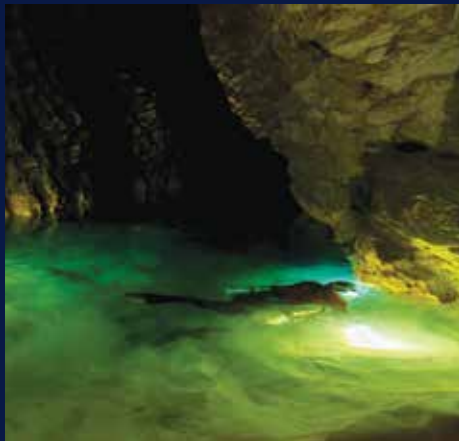
The Ario Dream People's Choice Winner 2017

For filmmakers, the People's Choice film prize is a big deal. It is direct confirmation, from the people who matter – you, the audience – that their film is your favourite.